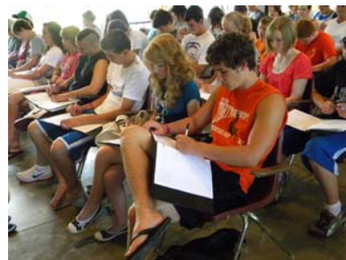
LARGE GROUP TRAINING SESSIONS