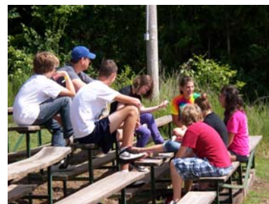
SMALL GROUP TRAINING SESSIONS